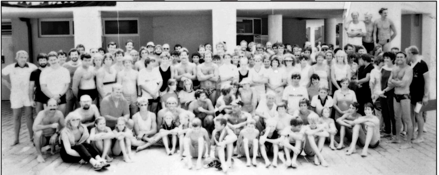
Gala Day club photo 1984.

This is photo #281 from the clubs photo database.