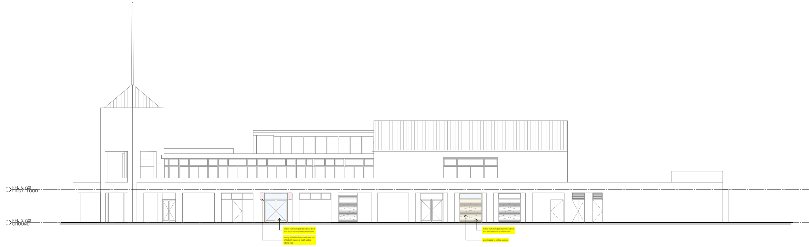
E01 EASTERN ELEVATION 1:50